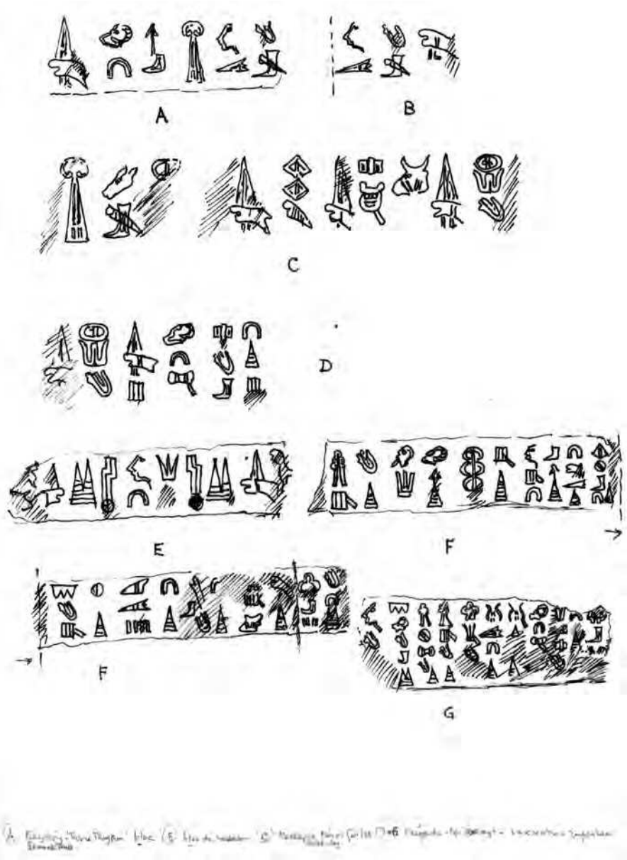
Fig. 5. Remaining inscriptions: Beyköy 3-4 (A-B), Şahankaya (C), Dağardı 1 (D), and Dağardı 2 (E-G). Copied by Charles Perrot and depicted here in the ink tracing produced by James Mellaart during the 1970s.