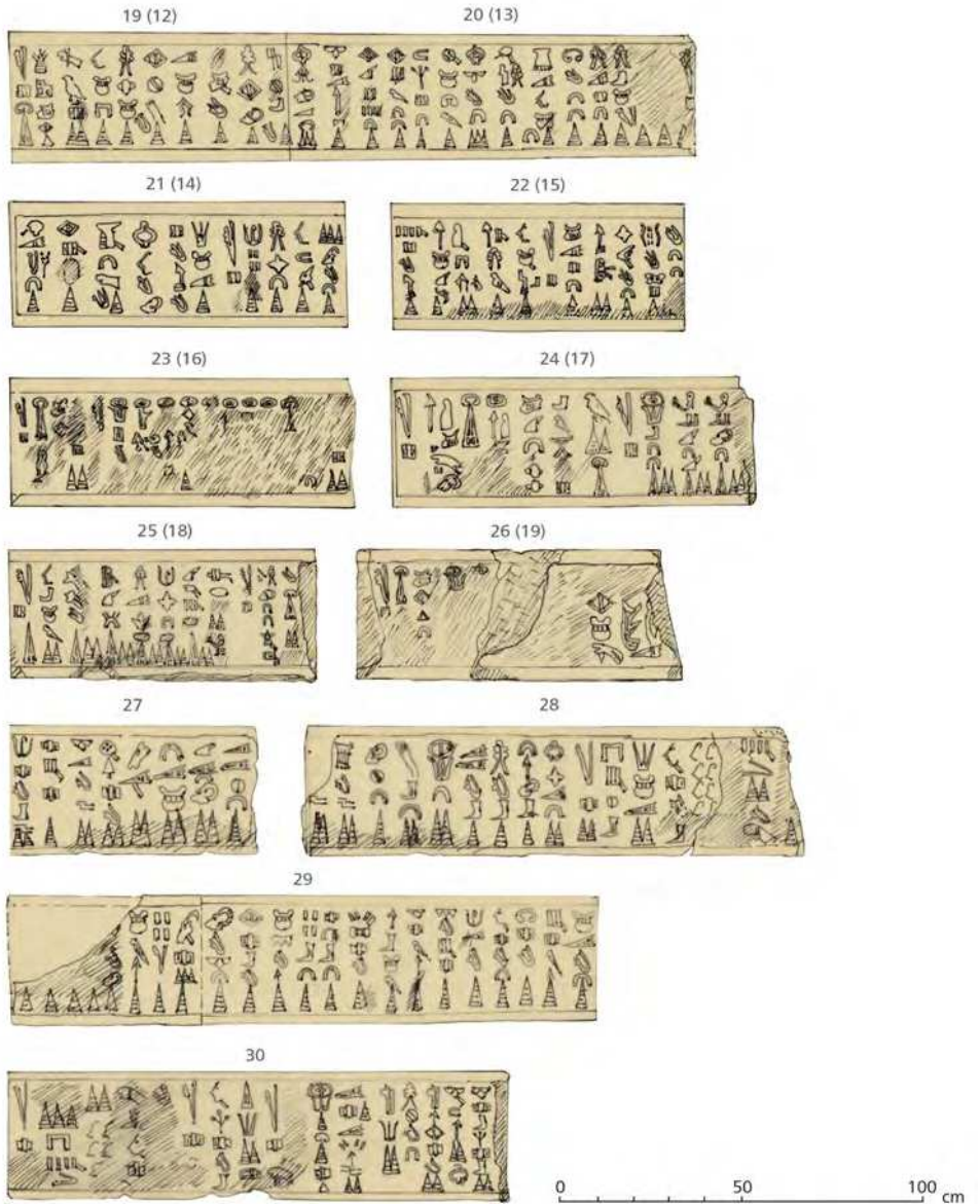
Fig. 1. The 29-meter-long Luwian hieroglyphic inscription (Beyköy 2) as recorded by Charles Perrot in 1878 is depicted here in the ink tracing produced by James Mellaart during the 1970s. The numbers in parentheses record the sequence of the stones as it was drawn by Perrot and Mellaart. Also published in Zanger 2017, 312-313.