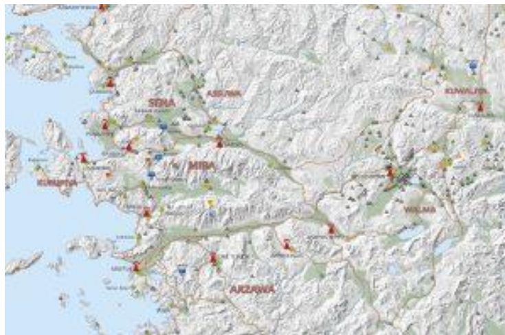
Topographic map indicating the situation around 1200 BCE, using geographic coordinates of all 477 settlements sites.

Virtually all of the field projects taken into account were conducted by Turkish archaeologists, whose preliminary reports were mostly in Turkish. Each site that was catalogued has a local name and geographic