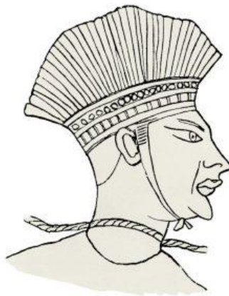
Line drawing of a feather crown warrior from the mortuary temple of Ramesses III showing the most distinct feature of the Sea Peoples.

Politically, the Luwian lands formed a patchwork of states and petty kingdoms that at times competed with one another, but also repeatedly entered into alliances, primarily for military purposes. Troy was a border town facing Thrace, a region with cultures clearly different from the Luwian. In the thirteenth century BCE, Troy evolved into a hub for long-distance trade, especially with Cyprus and Syria.