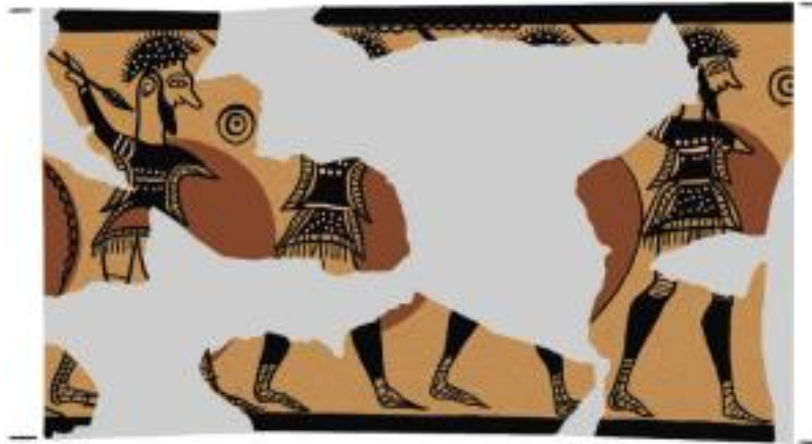
The reverse side of the Mycenaean warrior vase shows advancing warriors with lifted spears, feather crowns and round shields (after Furtwängler and Loeschke, Mykenische Vasen ).