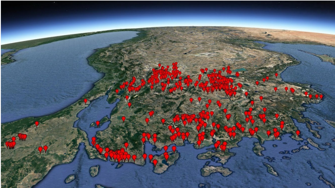
Google Earth image with localities of known settlements in western Asia Minor around 1200 BCE.